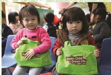
學校積極參與·學生樂在其中 Active participation from schools, students enjoyed the program