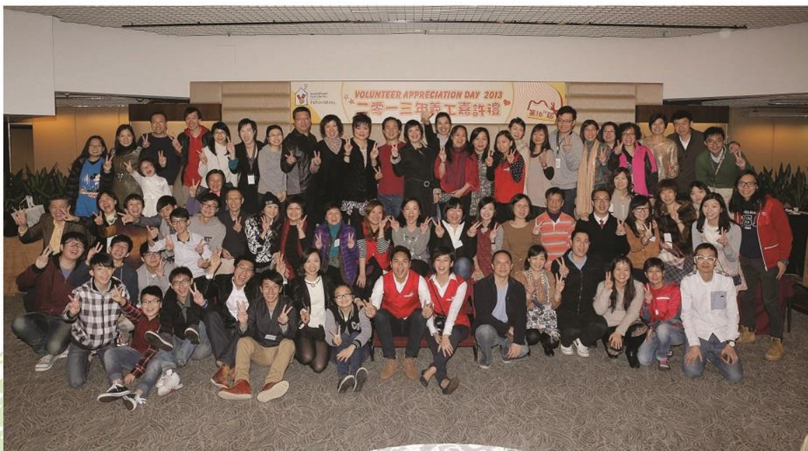
義工大合照 Volunteer group photo

一年一度的義工嘉許日於2014年2月8日假沙田麗豪酒店聚賢廳舉行，當日共有85名義工及33個機構代表參加。 The annual event, Volunteer Appreciation Day, was held on February 8, 2014 at The Forum, Regal Riverside Hotel in Sha Tin. 85 volunteers and 33 representatives from various organizations participated in the event.