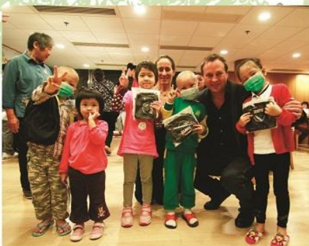
與小朋友一同玩遊戲 Game sessions with kids