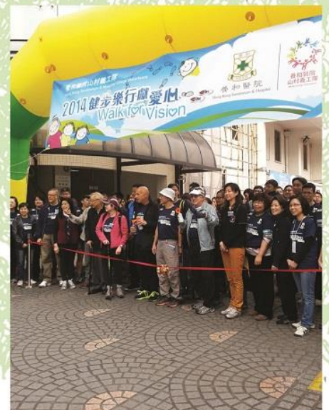
眾嘉賓一同參與起步禮 Guests attending the Opening Ceremony