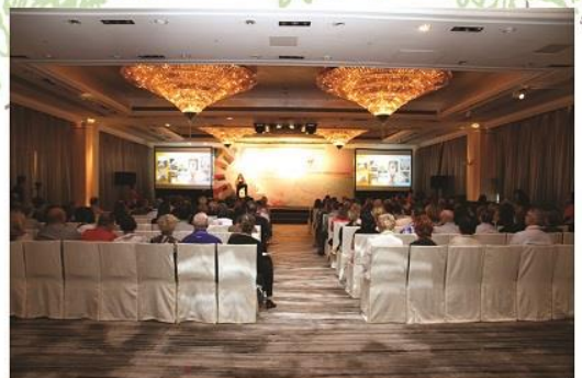
學術會議 Education Seminar