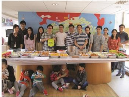
奧雅納工程顧問公司為我們預備豐富午餐 Lunch prepared by Arup