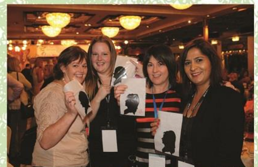
來自澳洲麥當勞叔叔之家慈善基金的代表於歡迎晚宴中留影 Delegates from RMHC Australia in Welcome Dinner