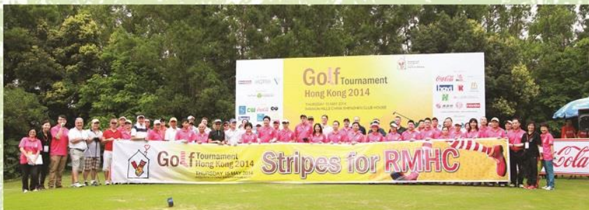
2014慈善高爾夫球賽 Golf Tournament Hong Kong 2014