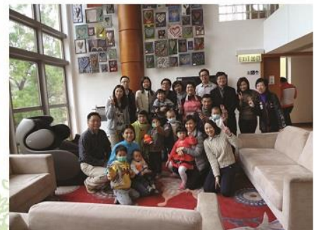
由友邦保險舉辦的下午茶聚 Tea party arranged by AIA