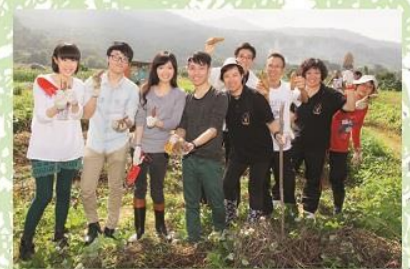
義工訓練 Training for the volunteers