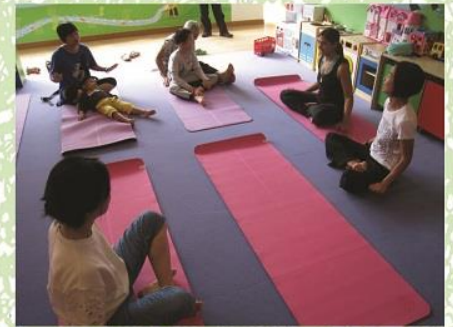
瑜珈班 Yoga Class