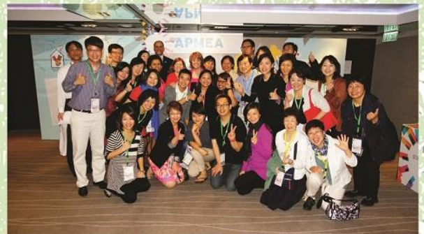
一眾亞洲區麥當勞叔叔之家慈善基金的代表 Delegates from RMHC Asia regions