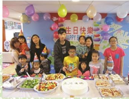
由美國婦女會舉辦的生日會 AWA arranged birthday party for kids