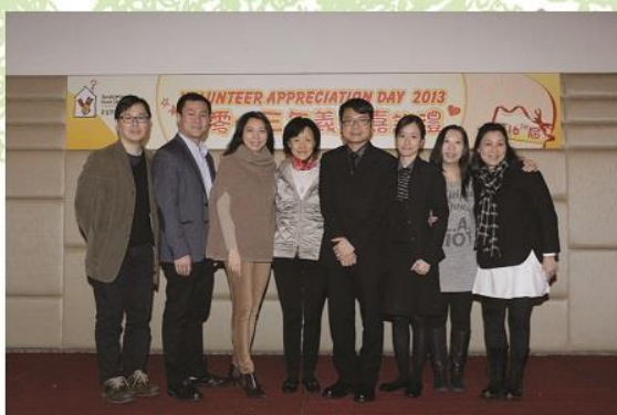
來自香港麥當勞的義工 Volunteers from McDonald's Hong Kong