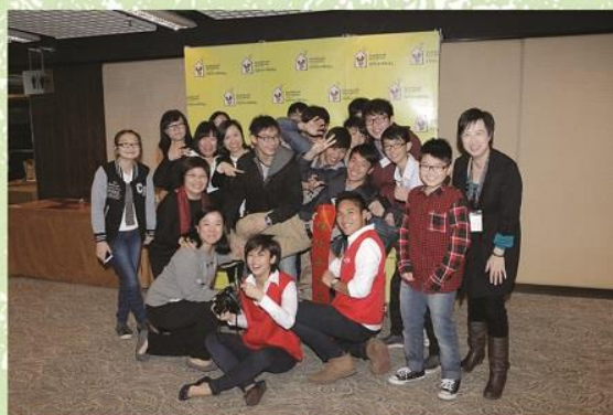
畫班及假日義工 Drawing class and weekend volunteer