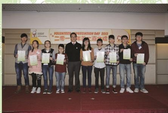
愛心伙伴 - 由康復病童組成的義工隊 Love compaine - Volunteer team formed by recovered sick children