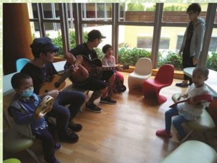
音樂班 Music Class