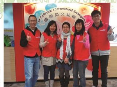
義工與學生分享綠生活心得 Volunteers shared green living tips with students