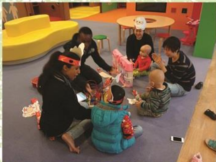
英文班 English Class