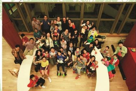
眾嘉賓及小朋友渡過了既有意義又歡樂的一夜 All guests and families had a good fun in this meaningful night