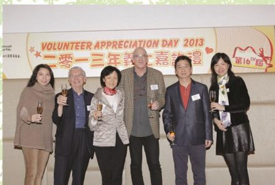
一眾董事會成員 Board members of RMHC Hong Kong